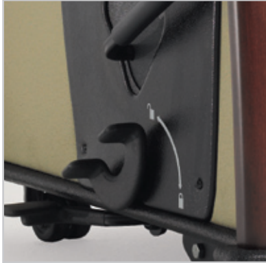
Central Caster Lock