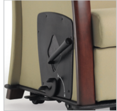
Recessed Assist Lever