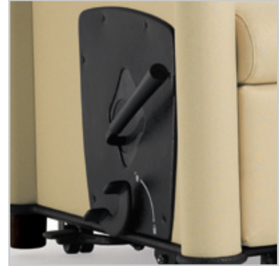
Recessed Assist Lever