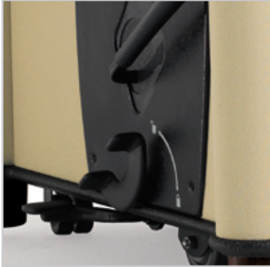
Central Caster Lock