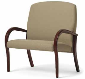
37771B30 HIGH BACK WALLSAVER