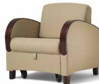
37841W SLEEP CHAIR