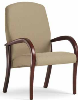
37771 PATIENT CHAIR