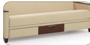
Drawer, no ottomans (Upholstered panels provided in place of ottomans)