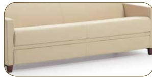
Continuous Panel (No drawer or ottoman)