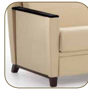
Recessed with Uph Panel 602 Series