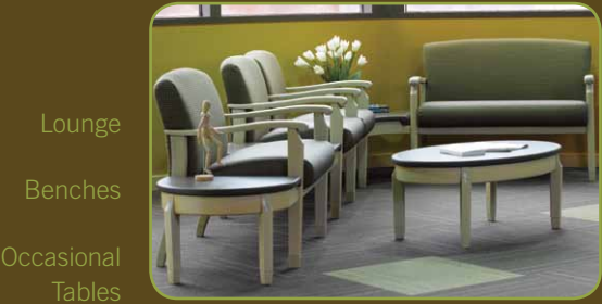
Lounge Benches Occasional Tables

waiting is always easier when you're waiting with a friend.