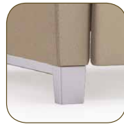
Metal Leg (Optional)