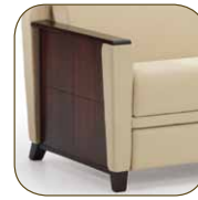
Recessed with Wood Panel 603 Series