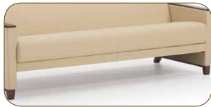
Open Base (Standard)