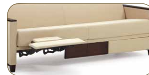
Ottoman, no drawer (Wood panel provided in place of drawer)