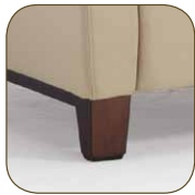
Wood Leg (Standard)