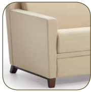
Soft Arm 600 Series