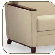
Fully Uph Arm with Cap 601 Series